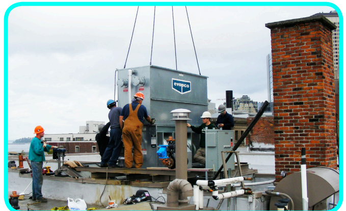
Cooling Tower Replacement Grand Central Building - Seattle, WA